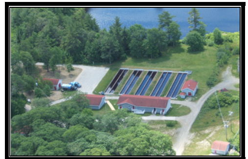
McGowan Lake Fish hatchery built 1987

An additional 200 lakes are stocked in the fall, usually after the angling season closes as part of our fall enhancement program. Brook trout account for most of this effort but Brown trout and Sea-run Atlantic salmon populations are also enhanced at this time of year. In recent years, the hatcheries have been able to provide additional Rainbow trout to sites with winter seasons as the Department of Fisheries and Aquaculture looks to expand winter angling opportunities.